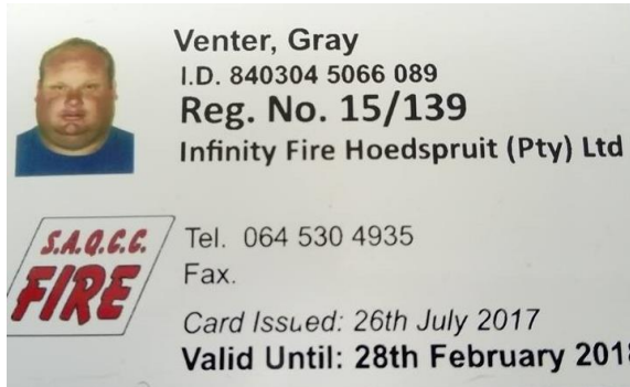
Front of your Card